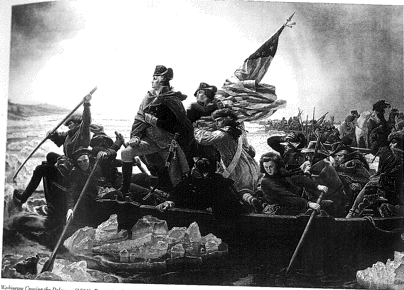
Washington Crossing the Delaware (1851), Eastman Johnson. Copy after the Emmanuel Leutze painting in the Metropolitan Museum, New York. Private collection.

precipitate, for we were near three weeks in performing it, and the country might 110 have time to come in. Twice we marched back to meet the enemy and remained out till dark. The sign of fear was not seen in our camp, and had not some of the cowardly and disaffected inhabitants spread false alarms through the country, the Jerseys had never been ravaged. Once more we are again collected and collecting; our new army at both ends of the Continent is recruiting fast, and we shall be able to open the next campaign with sixty thousand men, well armed and clothed. This is our situation, and who will may know it. By perseverance and fortitude we have the prospect of a glorious issue; by cowardice and submission, the sad choice of a variety of evils—a ravaged country—a depopulated city—habitations without safety, and slavery without hope—our homes turned into barracks and 120 bawdy-houses for Hessians, and a future race to provide for whose fathers we shall doubt of. Look on this picture, and weep over it!—and if there yet remains one thoughtless wretch who believes it not, let him suffer it unlamented. 🔄 📖